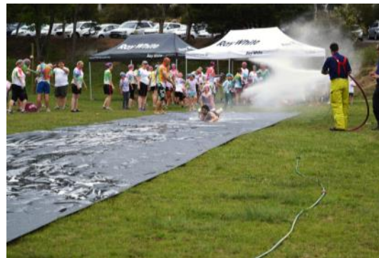
Camp Quality enjoying a wash down and slippery slide courtesy of the local Furies after a game of Slime Time

As a part of our mission, Greenhills has also been focused on supporting various community and charity groups. We have been privileged to host, amongst others, the national Cambodian Adoptive Families retreat, the ACT Adoptive Families camp, Canteen, Camp Quality, and Stella Bella Little Stars all within these last few months.