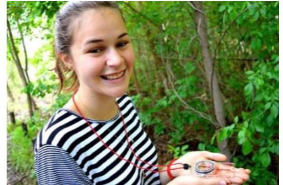
Our new trainee