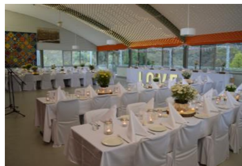
The Dining Hall transformed for the Reception

The bridal party as well as Greenhills staff members had worked for many hours on the Thursday and Friday to transform the dining hall. It had fairy lights up on the ceiling, tables beautifully arranged with white tablecloths, white chair covers and simple but very elegant centrepieces. The view from the dining hall looking out over the mountains during sunset was spectacular, and the fairy lights twinkling away during the evening made for a very elegant atmosphere. The bridal table had its own stage with very large light up letters in front spelling the word 'LOVE'.