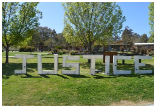
The theme of the festival was JUSTICE in all its forms

This year Greenhills has been focused on going above and beyond in all areas. We have focused on our service, our venue, and our mission. That mission is to be a place where people can come together as a community. The epitome of this focused effort was without a doubt the Beyond Festival .