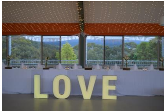
The Bridal table with Greenhills and the Brindabellas as a beautiful backdrop

Many of the happy couple's family and friends chose to stay at Greenhills enjoying the lovely surrounds.