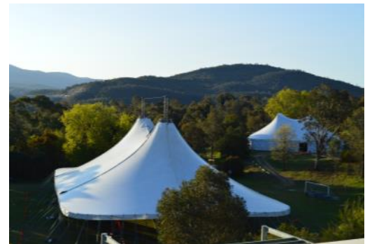
The Marquees on the Oval

Greenhills was truly privileged to host the festival and its impressive line-up of artists. Our staff team worked around the clock to take care of the largest number of people that have stayed at Greenhills in its 50 year