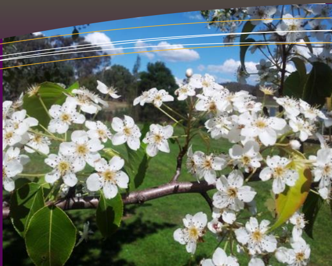
Spring blossoms near Zeta Hill Memorial garden