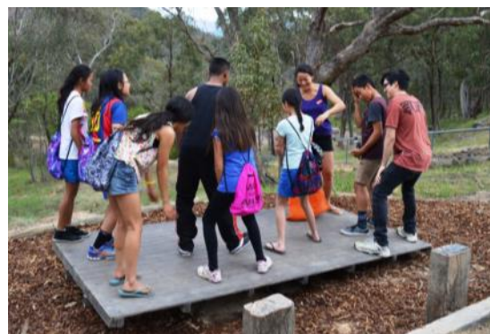
Balancing on the "Spirit Level"

Along with these high-intensity activities, we now offer a variety of low-intensity activities ranging from games for pure fun such as "Slime Time", Night Hikes through our wonderful bushland, "Clash of Clans" and other team building activities, "The Amazing Race" and, of course, our ever popular Campfire nights.