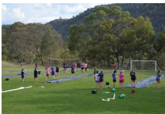
Water Games on the Oval.

We were interested to learn—and you might be too—that "fono" is short for Fonomarae, as their website explains, "Fonomare is the name given originally to