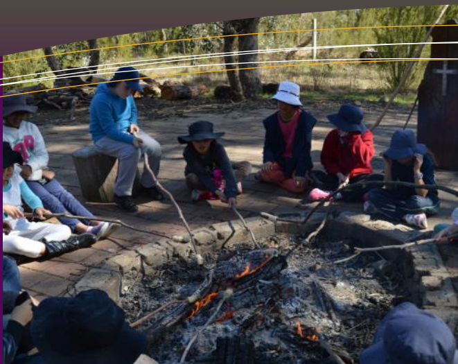
Toasting Marshmallows on the Campfire