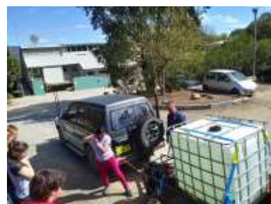
Cynderella starting the generator