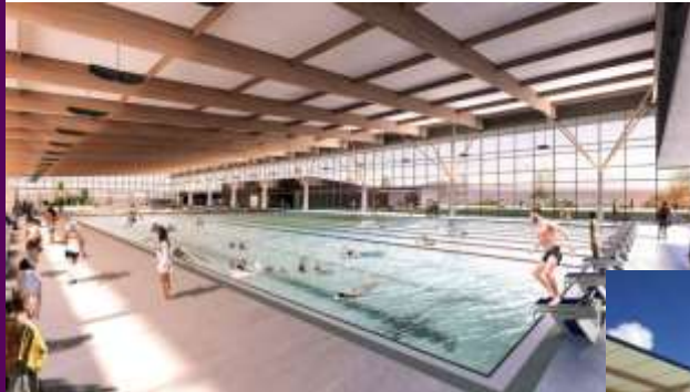
The proposed 50-metre pool at the new leisure centre

If you are looking for something new to do in the Canberra region while staying at Greenhills, in a couple of years time there will be a new leisure centre built in Stromlo just up the road. Construction on the new leisure centre began in September. The leisure centre will include a 50-metre lap and competition pool, a program pool for activities like swimming lessons and aqua aerobics, a reception, kiosk, administration offices and change rooms. The leisure centre will also include a gym, leisure pool, toddler pool, splash park, crèche and seating throughout the centre. Construction on the facility is expected to be complete in early 2020. This facility will be a fantastic addition to the local region near Greenhills.