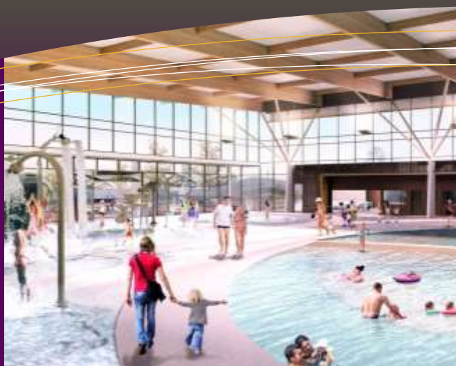
New Stromlo Leisure Centre—more info on page 3

A quarterly update from Greenhills Centre covering some of the events and achievements in the past few months. For the information of Friends of Greenhills, Staff and Board Members.