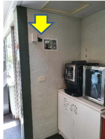
The Dining Room siren is located near the coffee machine

Guests supply rooming lists and will have a nominated Group Leader. Greenhills will roster staff to undertake Host duties including contact with Group Leaders. Greenhills Managers need to know generally which Guests, Staff and other Visitors are on site.