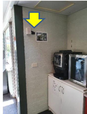
The Dining Room siren is located near the coffee machine

Guests supply rooming lists and will have a nominated Group Leader. Greenhills will roster staff to undertake Host duties including contact with Group Leaders. Greenhills Managers need to know generally which Guests, Staff and other Visitors are on site.