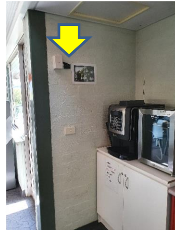
The Dining Room siren is located near the coffee machine

Guests supply rooming lists and will have a nominated Group Leader. Greenhills will roster staff to undertake Host duties including contact with Group Leaders. Greenhills Managers need to know generally which Guests, Staff and other Visitors are on site.